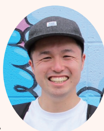
Manu A Photographer & guide